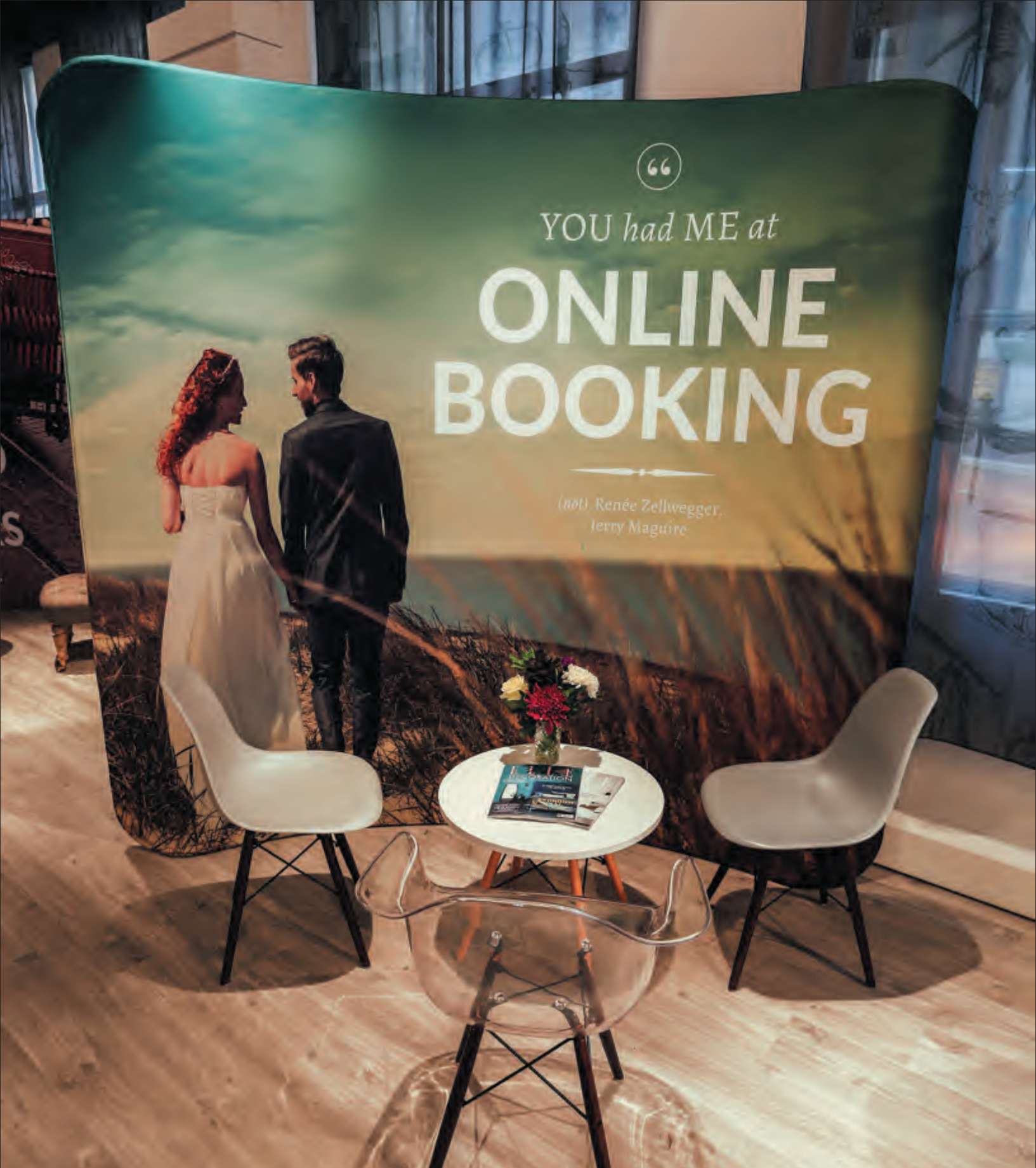
A Curve 24 ink-on-fabric display, inside Nettle of Birmingham Business Store. Each display comes in two parts – a lightweight aluminium frame, which clips together, and a fabric cover which stretches across the frame.